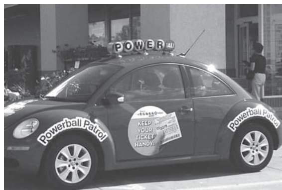
The Powerball Patrol Car traveled all over the state of Iowa in May and June, stopping for this photo op at the Fairfield Hy-Vee.