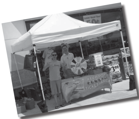
An Iowa Lottery player shows off the Hot Lotto Sizzler shirt he won on his visit to Bucky's Express in Council Bluffs.