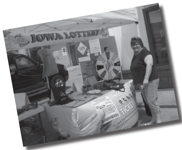
Left, a player holds onto her Powerball ticket tightly and thinks about spinning the wheel at KJ's Convenience & Deli in Maquoketa.